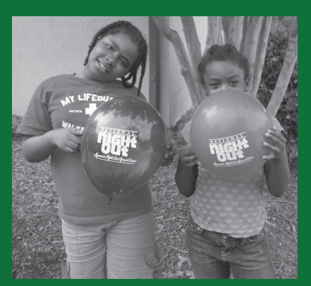
National Night Out celebrated.