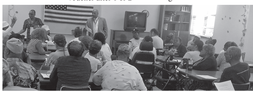
Residents attend RAD informational meeting at Hall Towers.