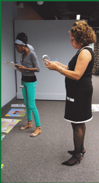
Judging for What Home Means to Me Poster Contest was held in May.

posters were received as a result of the art classes. Winners will be announced at the upcoming Housing America Month celebration in October.