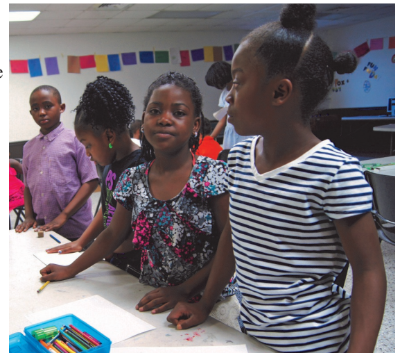
Art Classes were taught in five communities.