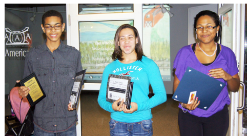
RECOGNITION: Young artists (top) received recognition for their accomplishments during Greensboro’s “Housing America” Celebration. Representative Alma Adams (left) visited the opening night of the art gallery.